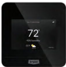
Housewise™ Wi-Fi® Thermostat

Bryant offers a range of solutions for managing your system. Whether you're looking for Wi-Fi® thermostats with energy reporting for the ultimate in connected control, optional zoning management or more basic thermostats—you'll have the system control you want.