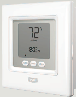
Legacy™ Line Models: T2-PAC Air Conditioner T2-PHP Heat Pump