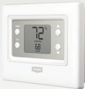
Legacy™ Line Models: T2-NAC Air Conditioner T2-NHP Heat Pump