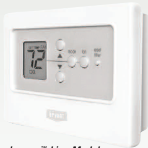
Legacy™ Line Models: T2S-NAC01 Air Conditioner T2S-NHP01 Heat Pump