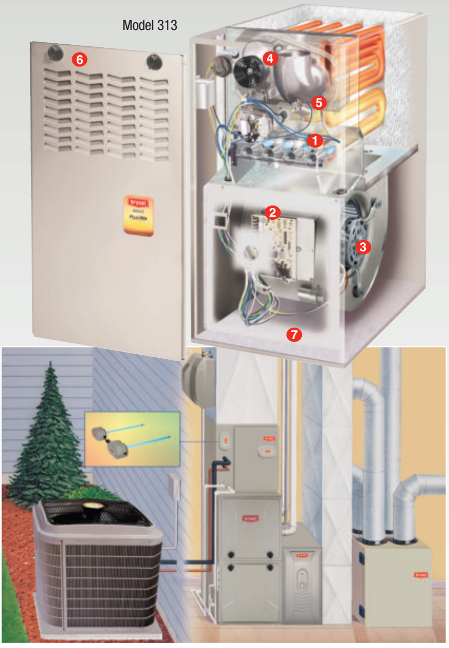
Air Conditioner and Gas Furnace System